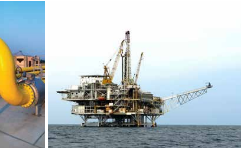
Solutions are tested before being commissioned