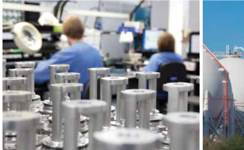
Each product is tested prior to leaving the factory