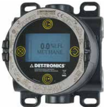
FlexVu® UD10 Universal Display