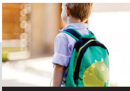
PUBLIC AND EDUCATION