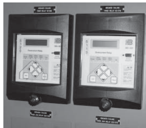
BE1-851 replacing GE-CHC, Bryan, Texas