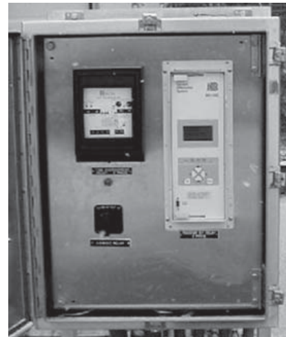
BE1-CDS220 replacing BE1-87T, Juneau, Alaska