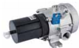
PointWatch Eclipse® IR Combustible Gas Detector