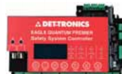
Eagle Quantum Premier® Safety System