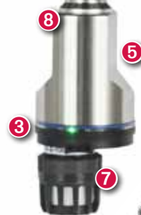
GT3000 Electrochemical Toxic Gas Detector