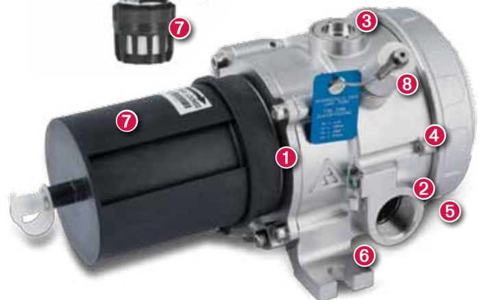
Pointwatch Eclipse® Infrared Hydrocarbon Gas Detector