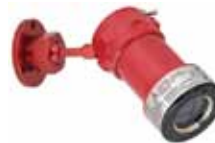
xWatch Explosion-Proof Surveillance Camera