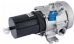
PointWatch Eclipse® IR Combustible Gas Detector