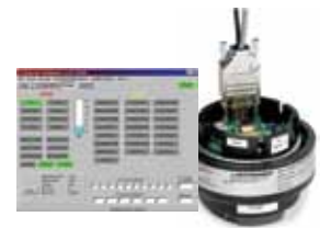
Inspector Connector with Monitor Software