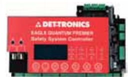
Eagle Quantum Premier® Safety System