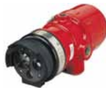
X-Series Weather Shield