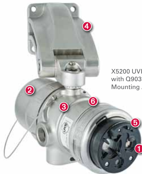
X5200 UVIR Flame Detector with Q9033B Stainless Steel Mounting Arm