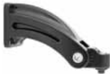
Aluminum Mounting Arm