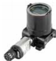
FlexVu® Universal Display with GT3000 Toxic Gas Detector