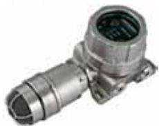
FlexSonic™ Acoustic Leak Detector