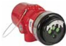
X3301 Multispectrum IR Flame Detector