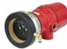
Universal Air Shield Assembly