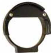
Field of View Limiter/ Weather Shield