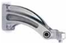
Stainless Steel Mounting Arm