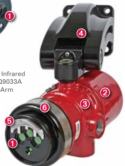
X3301 Multispectrum Infrared Flame Detector with Q9033A Aluminium Mounting Arm